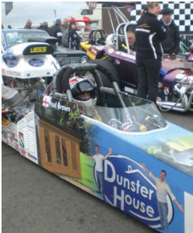
Dunster House - log cabins, garden rooms, climbing frames, UPVC windows and doors Tel: 01234 272445